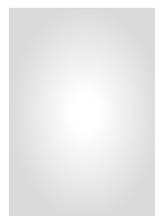
Amy Axtens Senior Underwriter

(03) 9009 4916 0466 539 241 inara.harris@aia.com